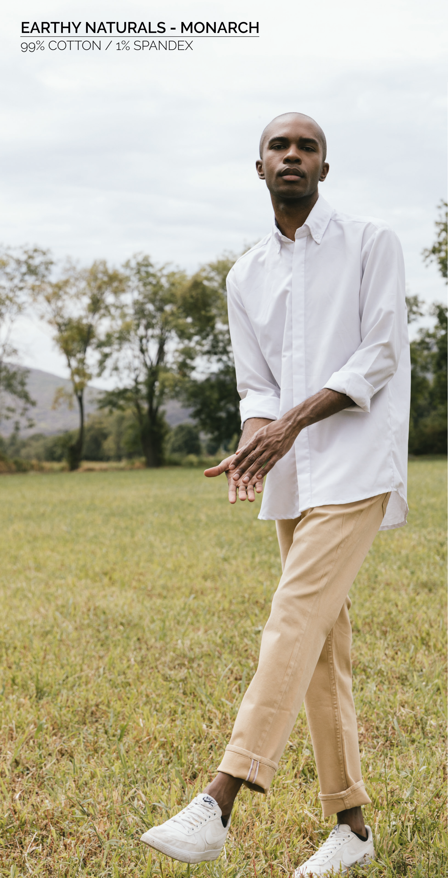
EARTHY NATURALS - MONARCH 99% COTTON / 1% SPANDEX