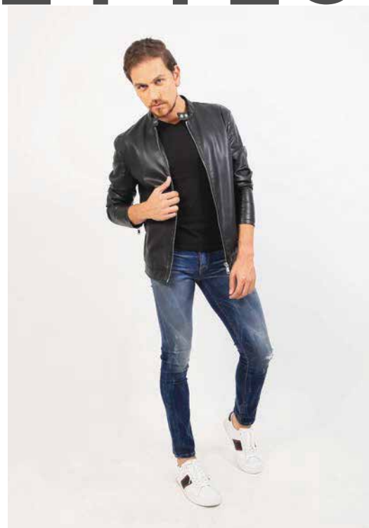
FREEDOM | JAMES

95% COTTON / 3% ELASTERELL-P / 2% SPANDEX