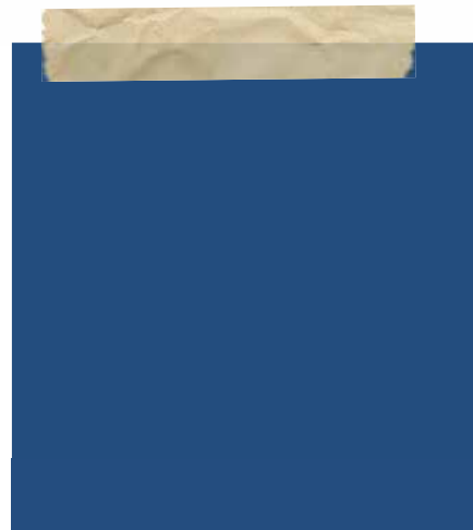
PANTONE® 19-4052 TCX Classic Blue