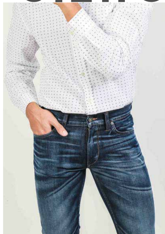
FREEDOM | BRANDO