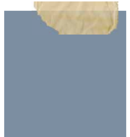
PANTONE® 17-4021 TCX Faded Denim