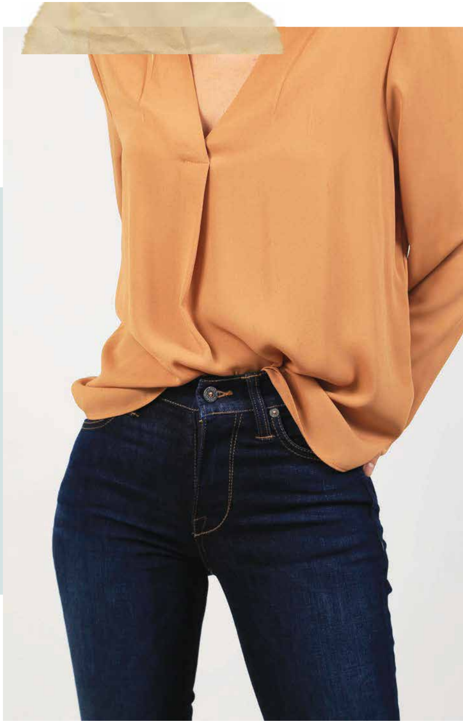
ALIVE STRETCH | CAPOTE