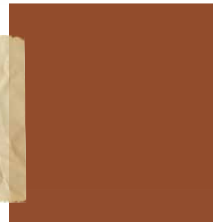
PANTONE® 18-1345 TCX Cinnamon Stick