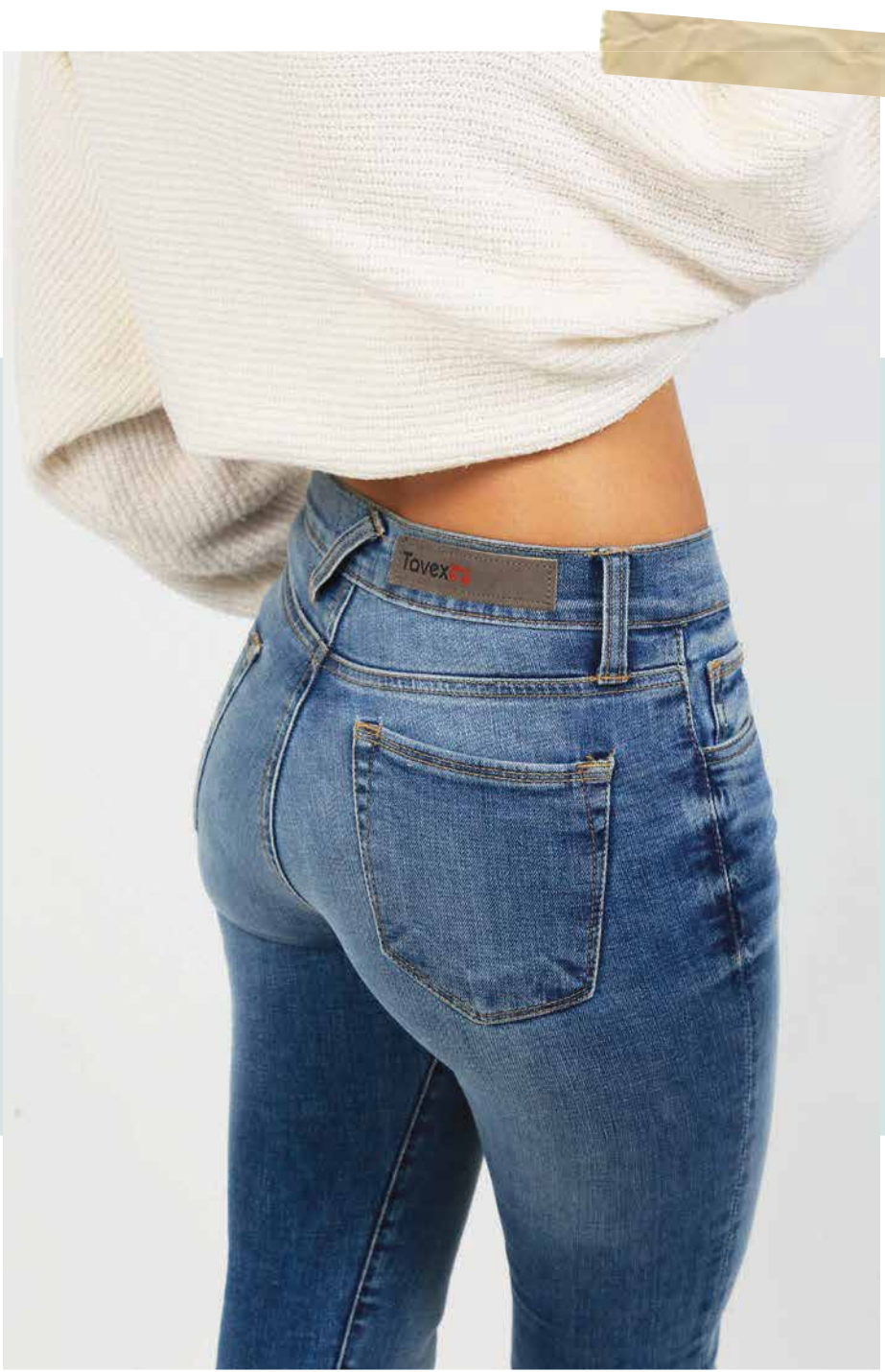
ALIVE STRETCH | BRIDGET

80% COTTON / 8% POLYESTER / 5% LYOCCEL / 5% ELASTERELL-P / 2% SPANDEX