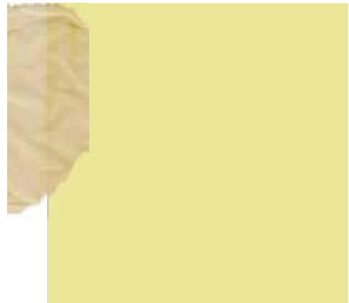
PANTONE® 11-0622 TCX Yellow Iris