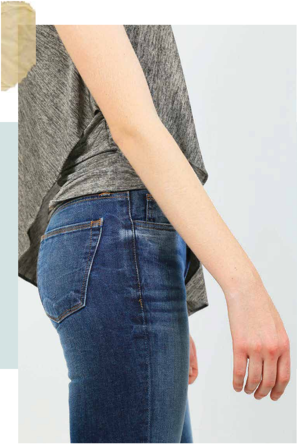
ALIVE STRETCH | SHANNON

80% COTTON / 8% POLYESTER / 5% LYOCCEL / 5% ELASTERELL-P / 2% SPANDEX