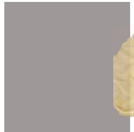
PANTONE® 16-3802 TCX Ash