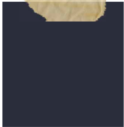
PANTONE® 19-3923 TCX Navy Blazer